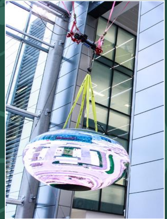
ELI-ALPS Laser Research Centre