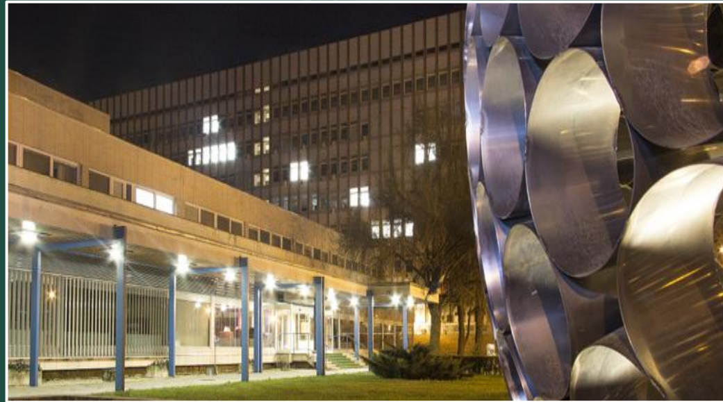
Szeged Biological Research Centre Hungarian Academy of Science