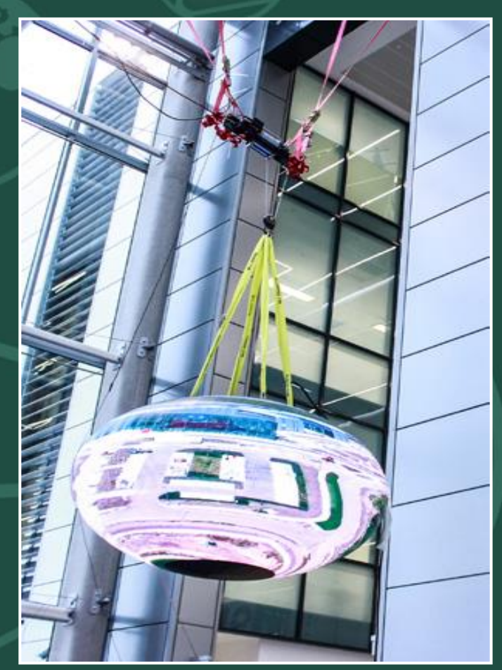
ELI-ALPS Laser Research Centre